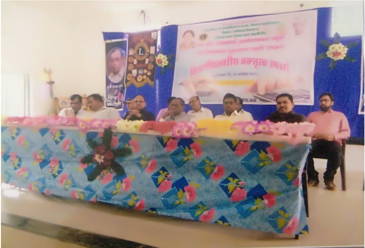
Elocution Competition One day Workshop on GST