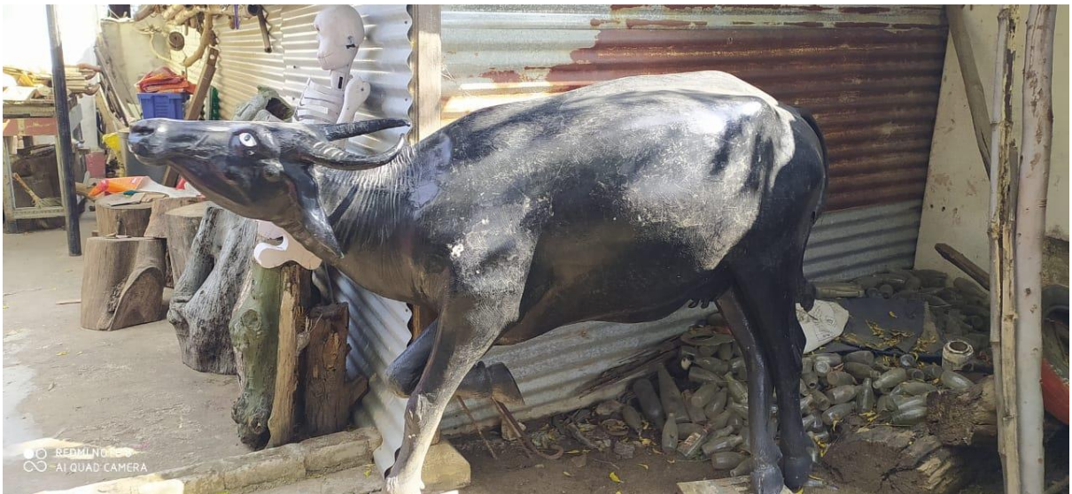
CRAFT WORK, ANANDVAN