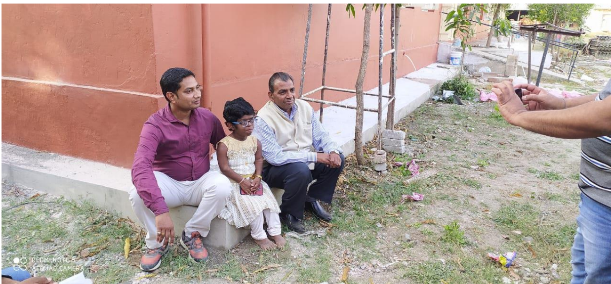
EDUCATIONAL TOUR AT ANANDVAN (WARORA) ON FEB. 2020