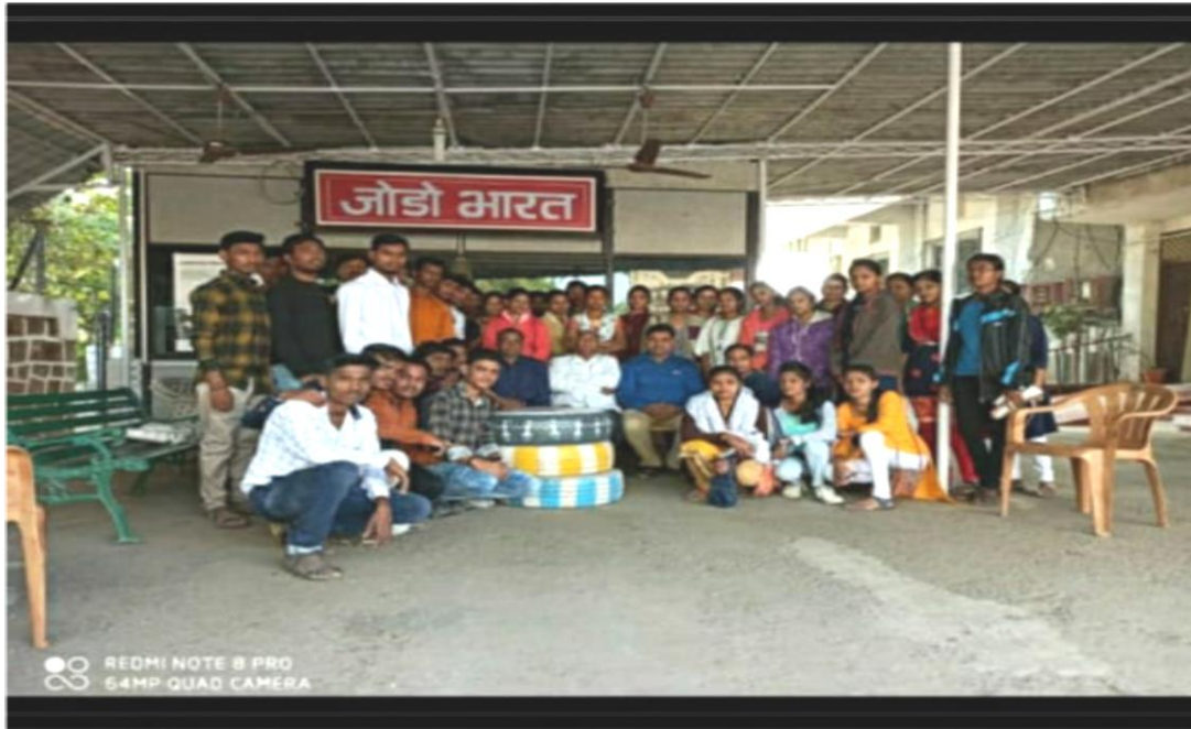
EDUCATIONAL TOUR AT ANANDVAN (WARORA) ON FEB. 2020