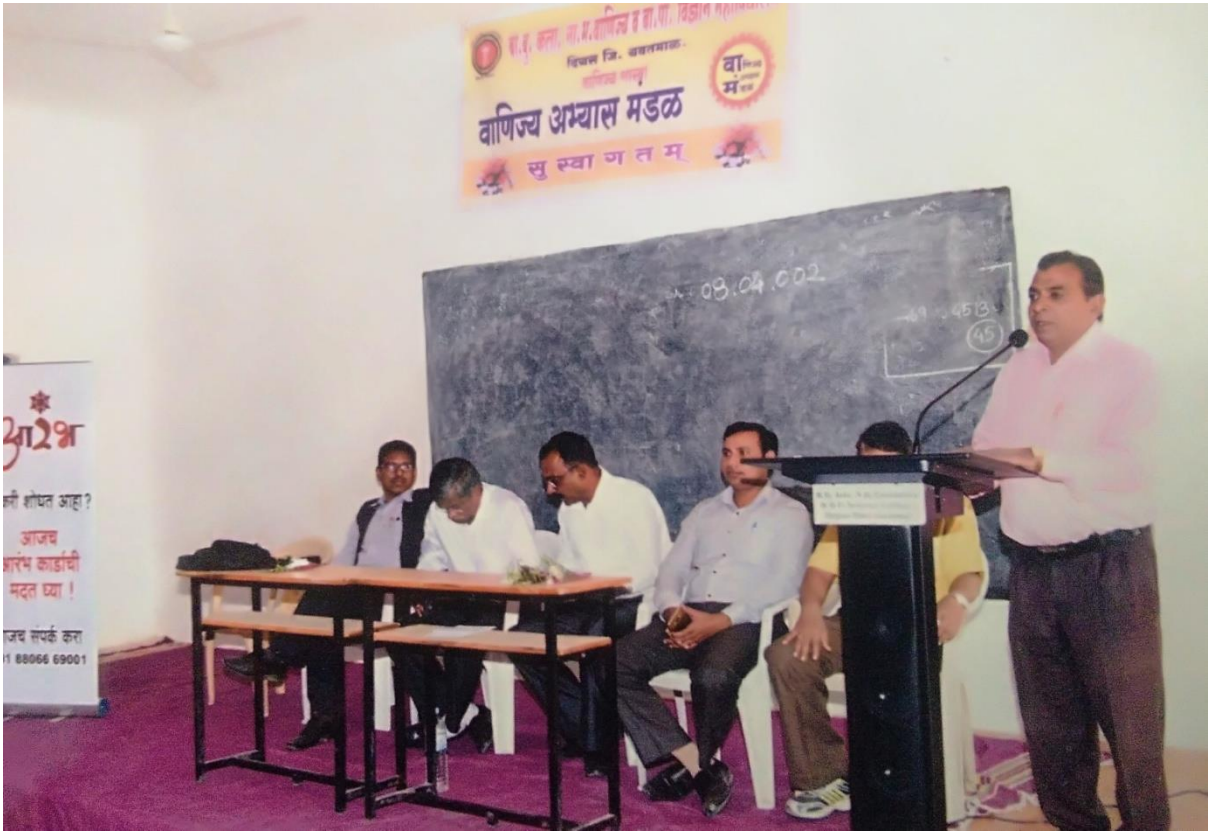
CARREER GUIDANCE BY AARAMBH CO. LTD. PUNE