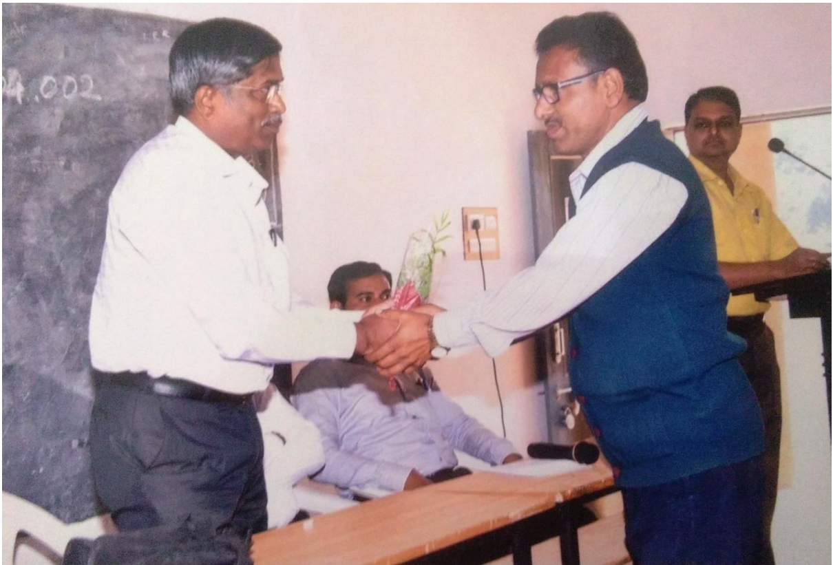
CARREER GUIDANCE BY AARAMBH CO. LTD. PUNE