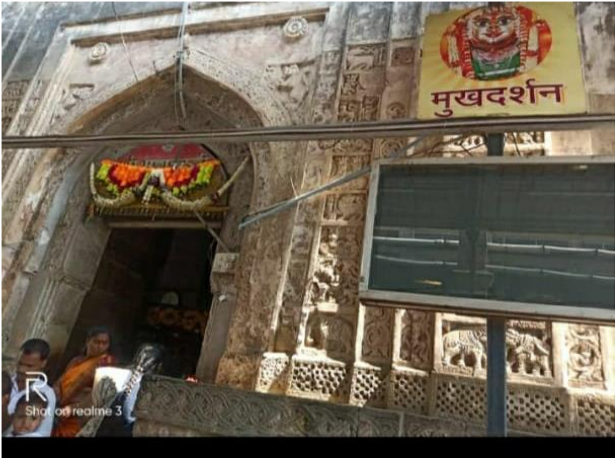
MAHAKALE MANDIR, CHANDRAPUR