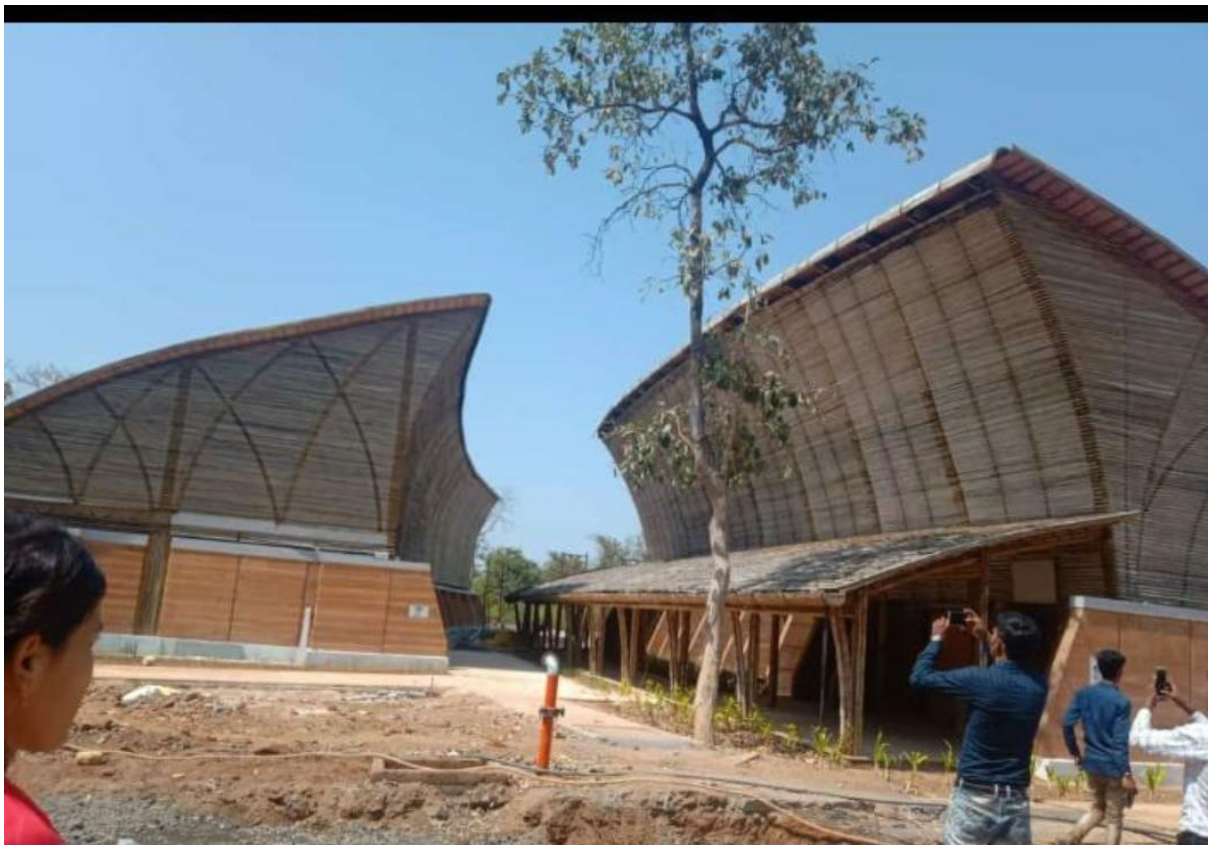
WORLD BIGGEST BAMBOO PROJECT NEAR MUL