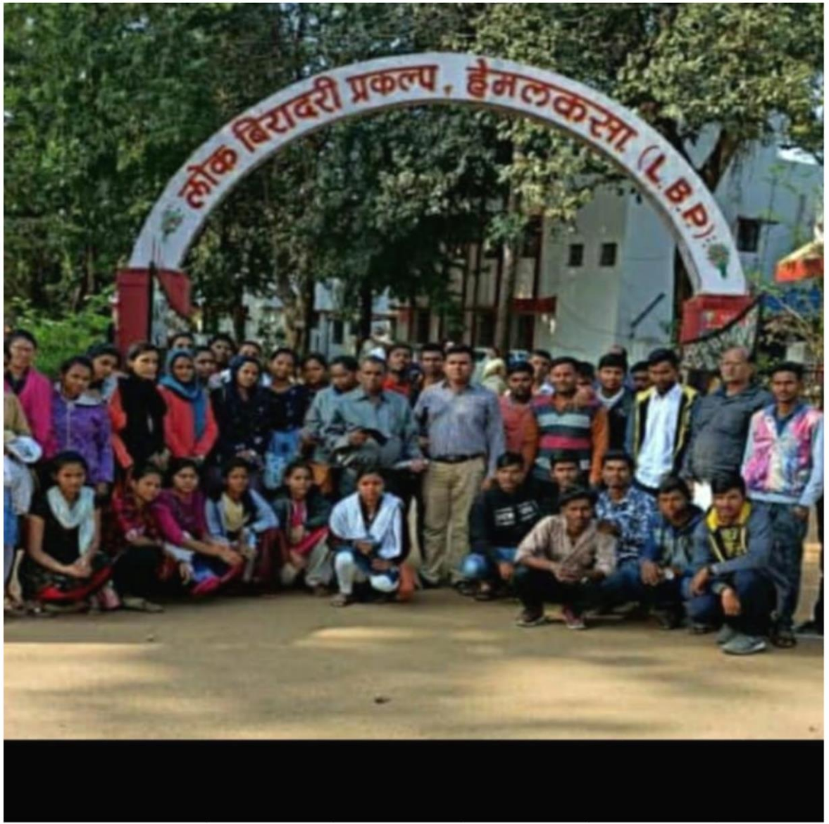
EDUCATIONAL TOUR AT HEMALKASA ON FEB. 2020